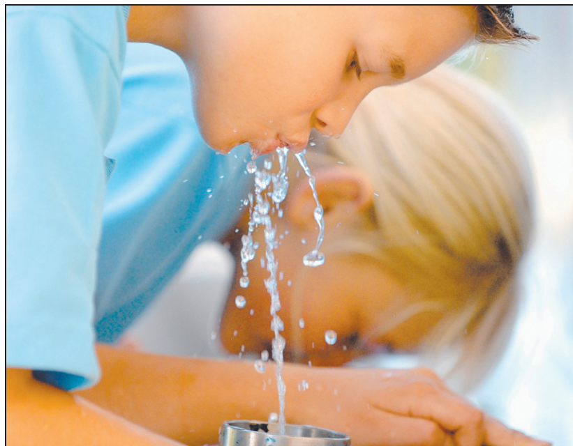
Hills Shire Council is one of few that still supply bubblers in parks.

However it appears to be one of the few providing bubblers at new developments.